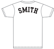
Name Only $23.22 + $9.67 (Set Up + Imprint)