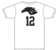
Design Doesn't Change but Number or Name Changes $23.22 + $11.60 + $9.67 ( 1 Set Up + 1 Repeat + 1 Imprint)