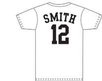
Name Changes and Number Changes $23.22 + $23.22 + $9.67 ( 2 Set Ups + 1 Imprint)

2" block letters and 8" collegiate numbers are standard.