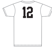
Number Only $23.22 + $9.67 (Set Up + Imprint)