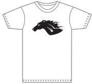
Design Only $23.22 + $9.67 (Set Up + Imprint)